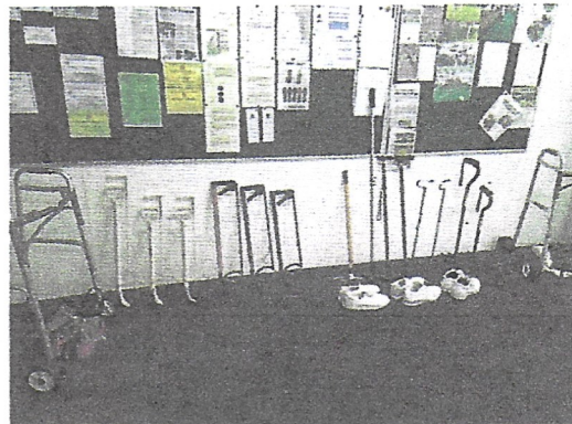
Right: Eastbourne IBC have bought a full range of disability aids, wheelchairs, bowling arms etc